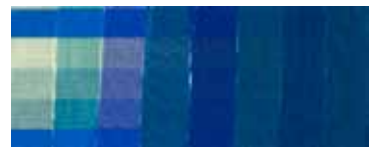
Standard reference blue scale